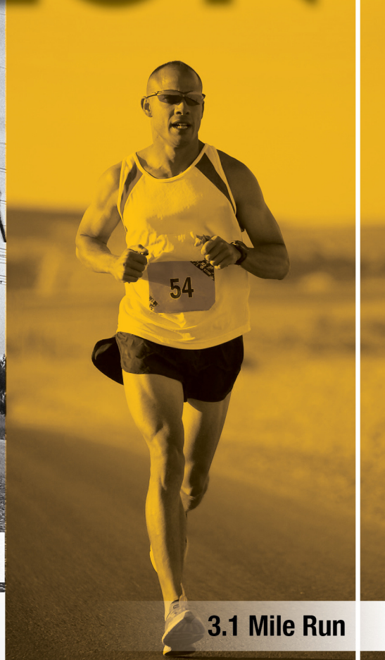
3.1 Mile Run