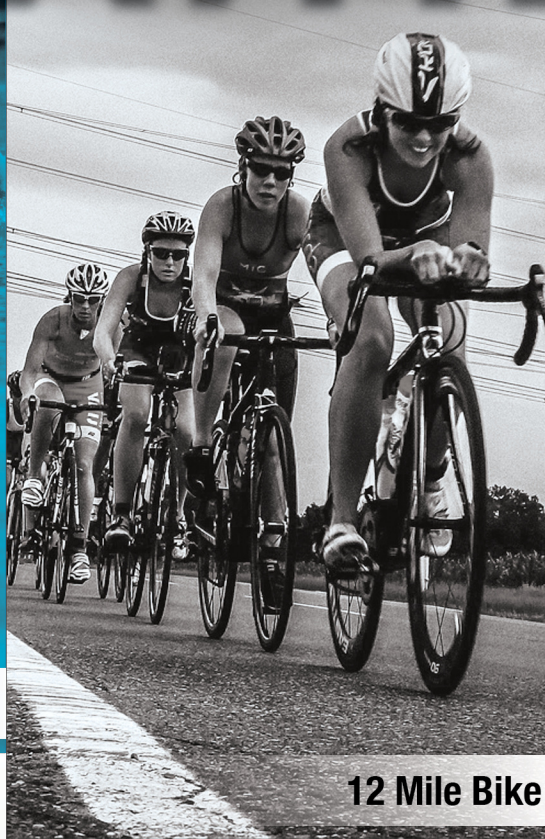
12 Mile Bike